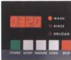
DIGITAL CONTROL & INFORMATION CENTER