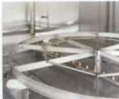
ROTATING TABLE WITH SPRAY ARM ASSEMBLY