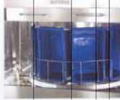
LUGS AND TOTES

The Douglas Model RBW-74 is a rotary batch washer designed to wash and sanitize containers commonly found in the bakery, meat, poultry, candy and foodservice industries. Containers include sheet pans, muffin pans, cake pans, lugs, totes, baskets, candy molds, trays, utensils, buckets, machine parts, and mixing bowls up to 140 quarts. This powerfully efficient machine features a space saving lift door design, a heavy duty 20 H.P. pump, a compact footprint and a generous 30 sheet pan capacity. It also features the company's newest product innovations including a push button control and information center that incorporates a digital display to monitor key performance functions and make the machine easier to operate and service.